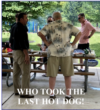
WHO TOOK THE LAST HOT DOG!