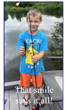
That smile says it all!